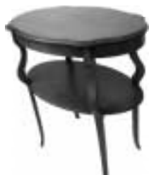
"Antique Row on Robertson" pg. 2

BEVERLYWOOD CADILLAC COUNCIL CASTLE HEIGHTS CRESTVIEW REYNIER VILLAGE REGENT SQUARE SORO MERCHANTS (Pico, La Cienega & S. Robertson Blvds.)